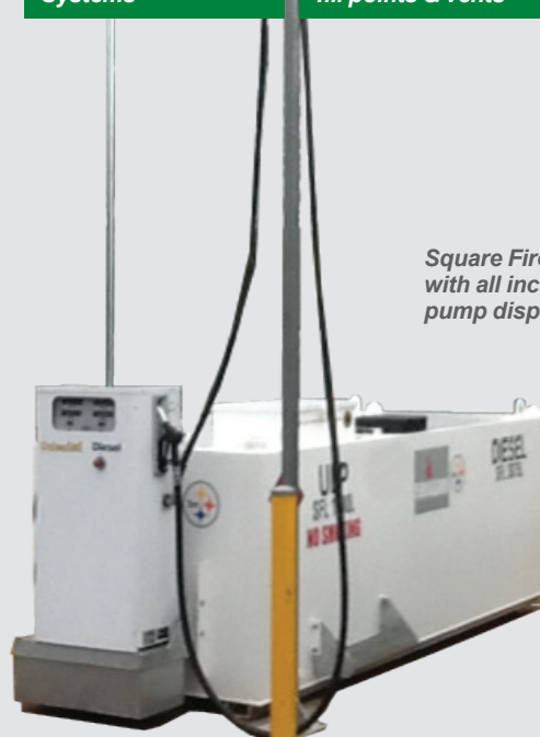
Square Fire Rated Tank – with all inclusive custom pump dispensing system