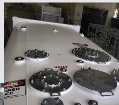
Square tank top – fill points & vents